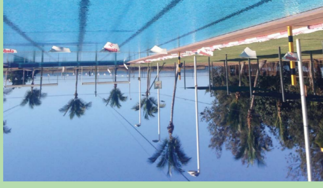
Gratwick Aquatic Centre, McGregor Street, Port Hedland