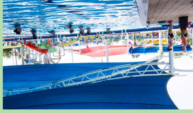
South Hedland Aquatic Centre, Leake Street, South Hedland