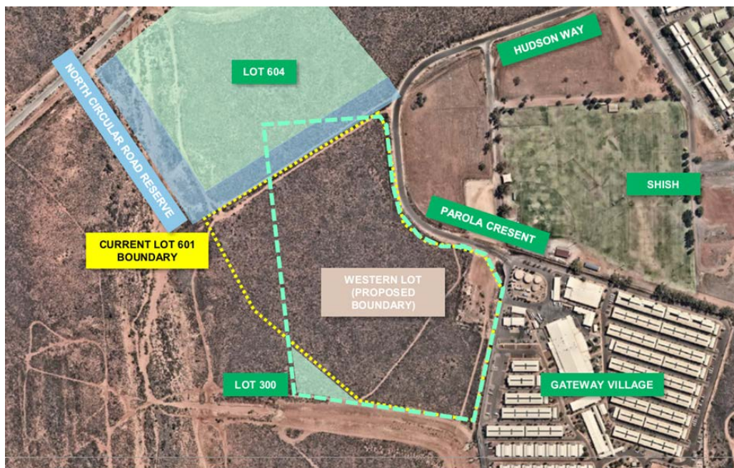
Figure 1 – Current and proposed boundaries for Lot 601

The current and proposed boundaries for Lot 601 are shown in Figure 1.