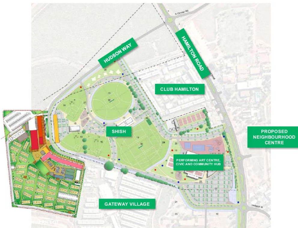
Figure 2 – Relationship of proposal to nearby development