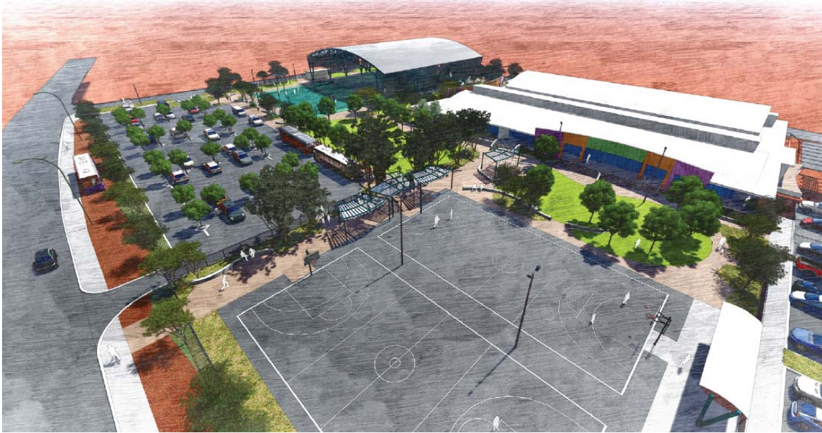
Figure 2 – JD Hardie Masterplan – Stage 1 - Artist Renditions