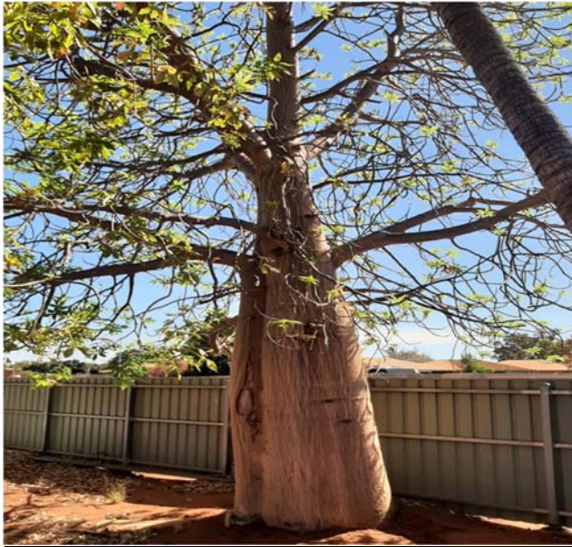
Figure 3 – Boab proposed for relocation

There is the opportunity to relocate the boab tree pictured in Figure 3 to the JD Hardie which is currently programmed for destruction. See Table 3 for cost estimate.