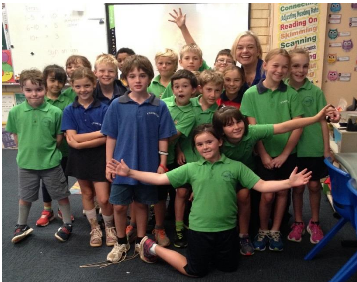
RSPCA school program at Hannans Primary School.