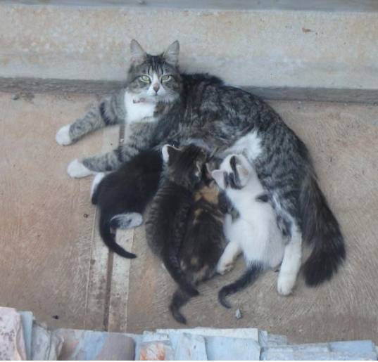
Abandoned cat and kittens - West Lamington. Two animals adopted, others in foster care.