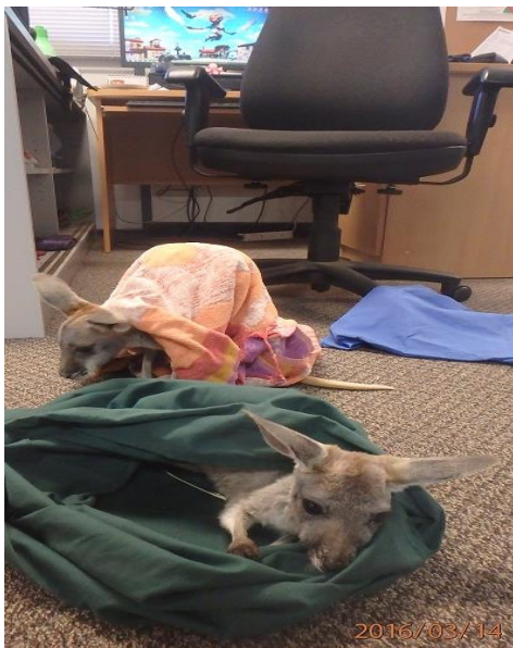
Two joeys chased by children. Now in foster care to recover and be released.