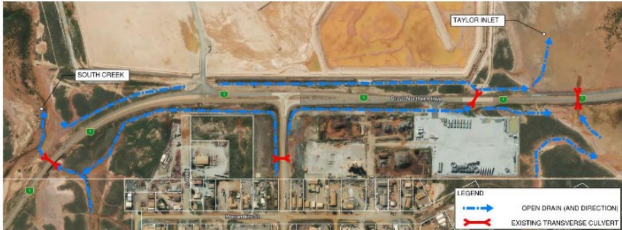
Figure 6: Existing drainage

In short the project will have no impact on the current drainage in Wedgefield.”