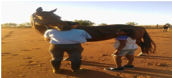
Healing Power of Horses