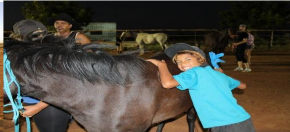
Healing Power of Horses