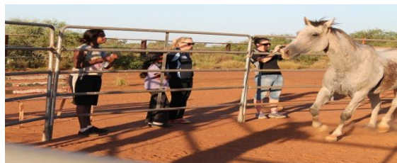
Healing Power of Horses