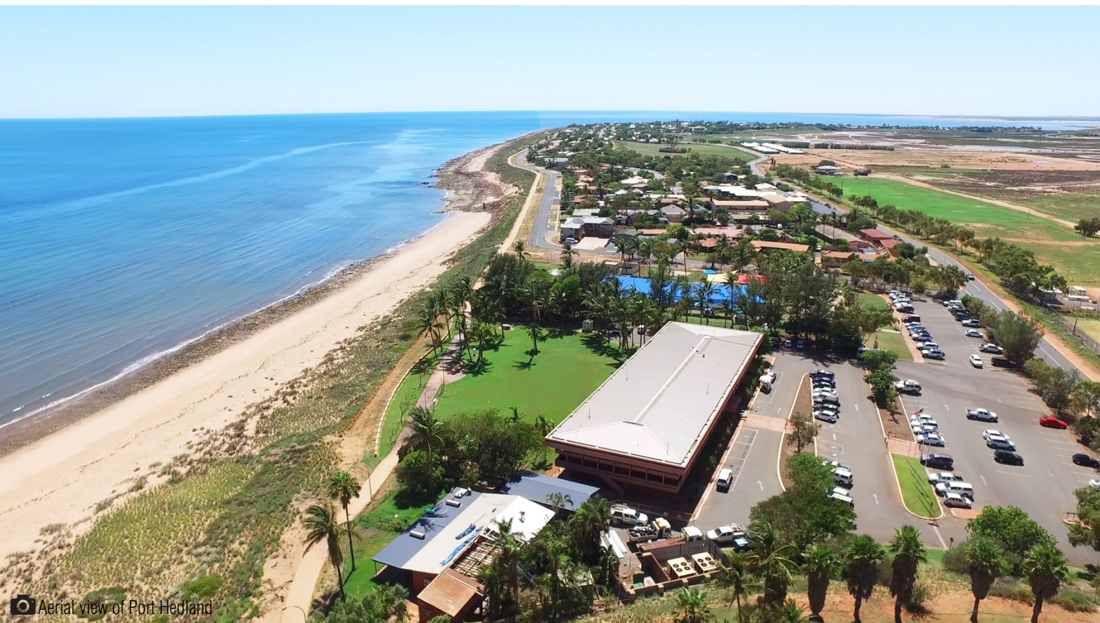
Aerial view of Port Hedland