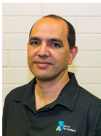
LINCOLN TAVO Term 2016 - 2017