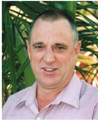
Mayor Brent Rudler (Retiring 2005)