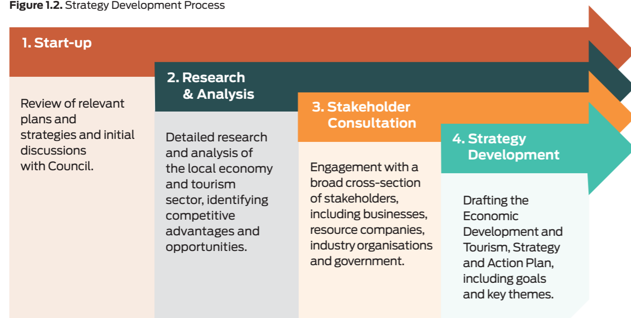
Figure 1.2. Strategy Development Process

This strategy should be read in conjunction with the Background Report and Consultation Summary completed for this project.