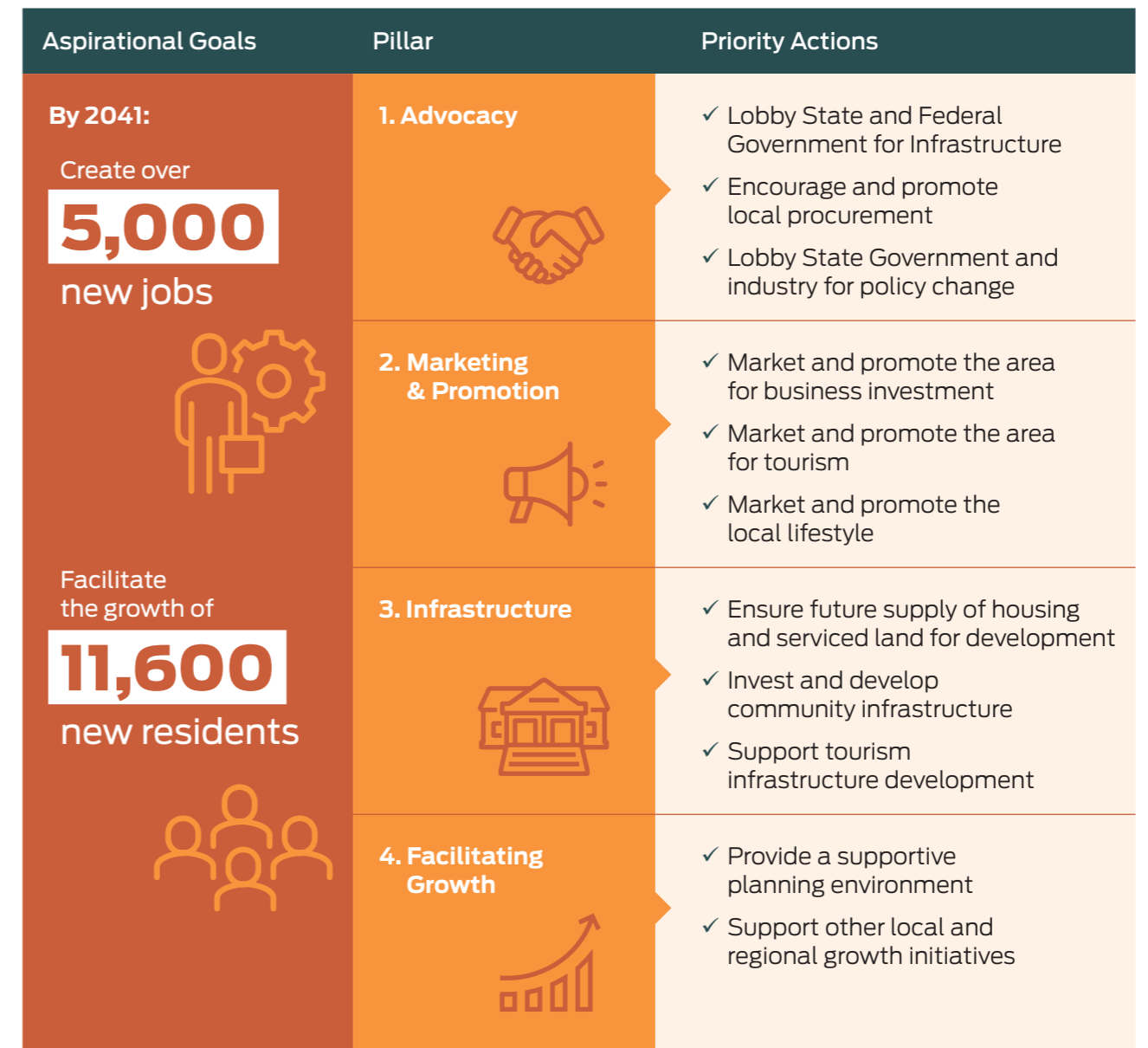
Figure 5.1. Town of Port Hedland Economic Development and Tourism Strategy Overview