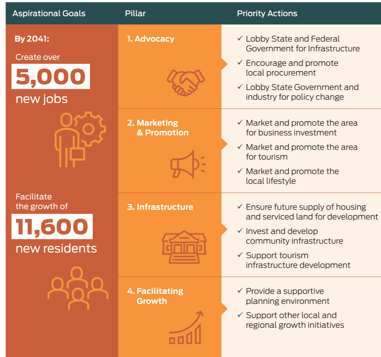
Figure E.1. Town of Port Hedland Economic Development and Tourism Strategy Overview