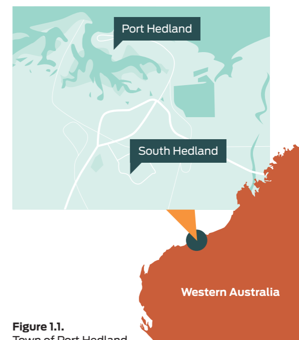
Figure 1.1. Town of Port Hedland

The Town of Port Hedland is located in the Pilbara region, around 1,800 km north of Perth in the north west of Western Australia. The local government area is globally and nationally prominent in mining and resources sector and includes the largest bulk export port in the world. While iron ore is the main export product, other commodities such as salt and lithium are also produced from the region.